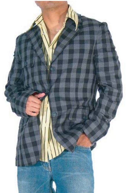
Ben Sherman blazer $149.00