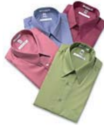
Geoffrey Beene $29.99