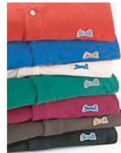
Le Tigre $48.00