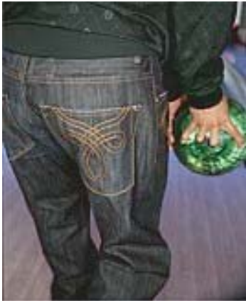
Sean John Embroidered Pocket Jean $74.00