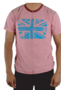
Hard 8 $34.00