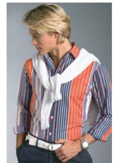
Polo Ralph Lauren $85.00