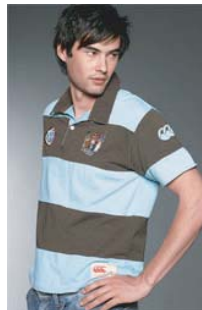
Canterbury of New Zealand $108.00