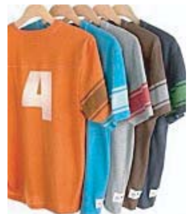
American Rag $19.50

trends for men include retro sport, rock & roll, preppy, screen tees, bold stripes, screen printed dress shirts, 70's & 80's inspirations and embroidered pocket jeans. Go full speed ahead with bold or muted tones.