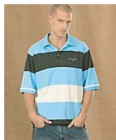
Sean John $68.00