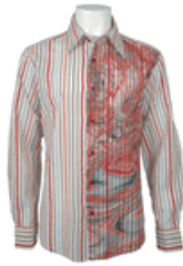
7 Diamonds $59.00