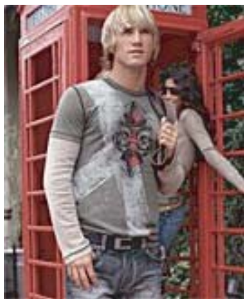
Mavi Jeans Brushstroke Layered Tee $38.00