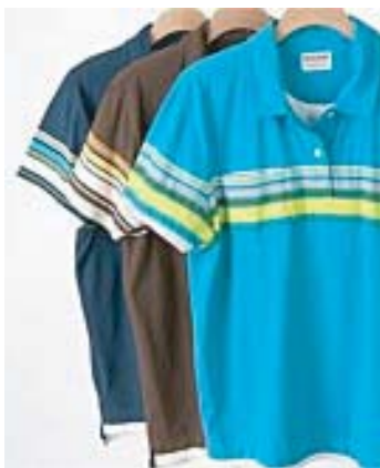
American Rag $29.50

trends for men include retro sport, rock & roll, preppy, screen tees, bold stripes, screen printed dress shirts, 70's & 80's inspirations and embroidered pocket jeans. Go full speed ahead with bold or muted tones.