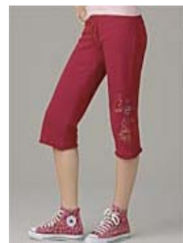
Princy by Jessica Simpson $49.00