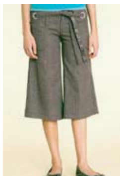
Triple 5 Soul $88.00