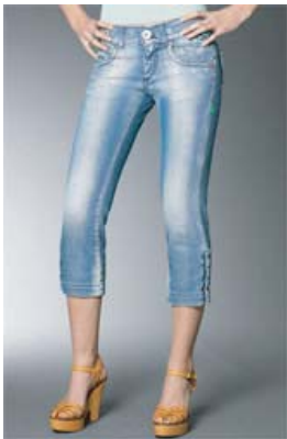
Miss Sixty $199.00