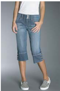
See Thru Soul $68.00