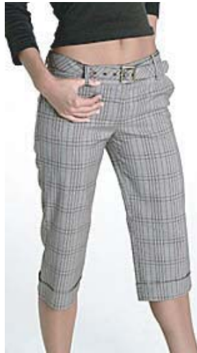
Hot Kiss $24.99