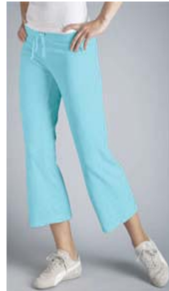
Juicy Couture $80.00